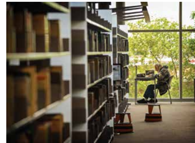
The northeast corner on the second floor features a 22-foot wall of windows, allowing visitors a view of Billings and plenty of light to read by.

Stella Fong spends time on land and water in Seattle, Billings and Big Sky. Her articles have appeared in The Washington Post, Blue Water Sailing and Yellowstone Valley Woman. When not writing she is fly fishing, bicycling and running.