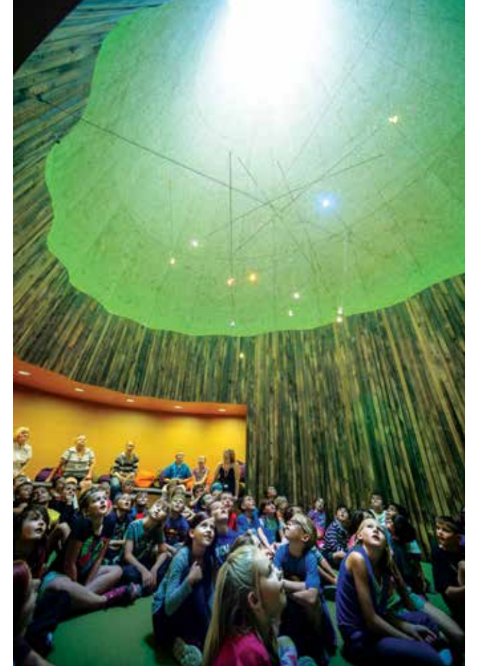
Right: Students gaze skyward during storytime inside the Story Tower, a 44-foot high elliptical space that ends at the top with a skylight.

"This library is familiar and surprising, massive yet minimal, mysteriously cloaked yet transparently ethereal — a form that carries both sunlight and shadow, snow and wind, with unexpected reflections and connections to the place," states Bruder. From Michael Sample's photo backdrop of the Rimrock Reflecting Pool of the Sacrificial Cliffs, to the use of Ryegate stone veneer at the entrance walls, to the reclaimed wood planks from the Underinner Motors building lining the outside of the Story Tower, pieces of Montana in actual and virtual ways are integrated throughout. Five coffee-sized "Extraordinary Tables" — built by Montana artists Scott Herries, Mark King, Colin Letts, James McGregor and Lee Proctor — in media including wood, concrete, steel, glass and stone provide more local contributions. But to experience the real sense of place, the northeast corner on the second floor offers the best testimonial with a 22-foot wall of windows. Views of the northern bordering sandstone rims are juxtaposed